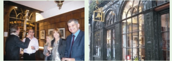
Cena a Berry Bros & Rudd Wine Cellar