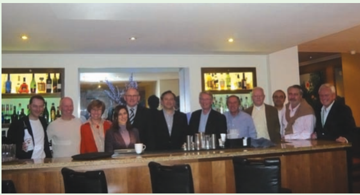
Comité ejecutivo a Londres